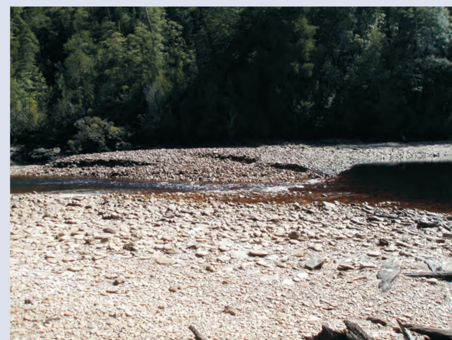
Bank attached lateral bar in Zone 1 comprising of a cobble matrix with classic imbrication visible in the foreground